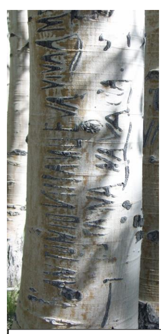
Antonio Villanueva Viva Navarra

Knives were the primary tool herders used to carve aspens. With soft, thin bark that easily scratched, a nail, obsidian or even a fingernail left an incision. Then the tree took over, the thin incision eventually becoming a scar that expanded as the tree grew and could remain legible for a century. Who could resist the contrast of dark letters imposed on a ghostly, white canvas?